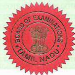
Chairman Board of Examinations Tamil Nadu